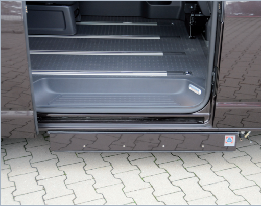
The K90 Active shown in stowed position. The ultra slim design guarantees ultimate ground clearance.

The new side underfloor lift for all active wheelchair users