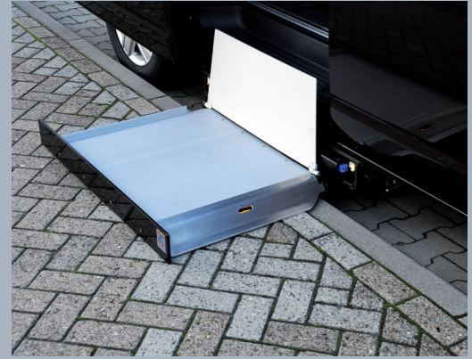
The K90 Active gives you market leading ground clearance on curbs.