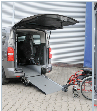
With the unfolded ramp the vehicle can be accessed comfortably with a wheelchair.

Toyota Proace Electric L1 / L2 (wheelbase 3,28 m - length: 4,96 m and 5,31 m)