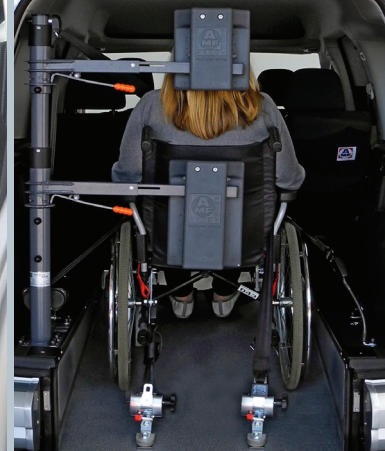
Optional the vehicle can be equipped with the head & backrest FUTURESAFE.