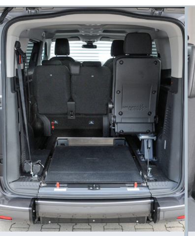
With the optional EASY FLEX ramp folded down the luggage compartment is fully usable.