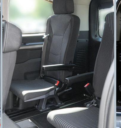
Optional tip & fold seats allow flexible use of the vehicle.